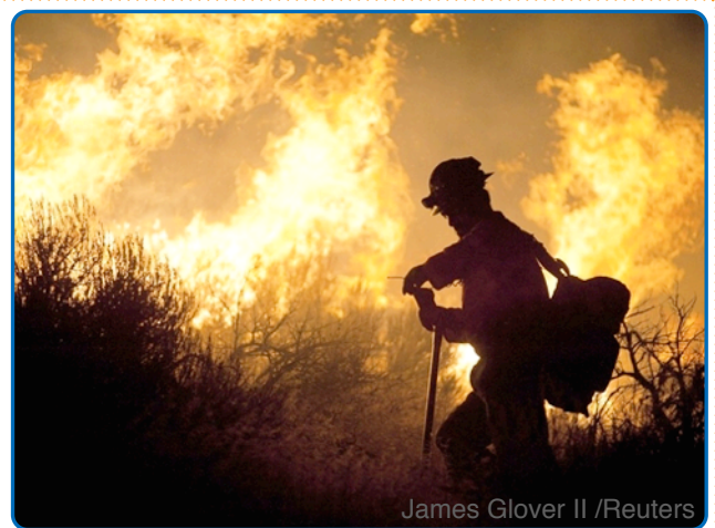
On January 19th, 2012, the mid-day sky was cast in an amber haze as strong winds tore through Northern Nevada. This time the wind was not refreshing, it did not bring with it the chill of winter as it usually would, this time it brought flames.